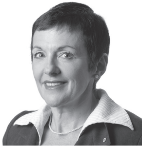
Kate Carnell AO beyondblue, CEO

Ms Carnell became the first Liberal woman to be elected as Chief Minister or Premier in Australia when she became Chief Minister of the ACT in 1995. Before that, she was a small business operator and pharmacist and the first woman National Vice-President of the Pharmacy Guild of Australia. Ms Carnell has been a beyondblue Director since 2008 and Deputy Chair since 2010. Beyondblue address issues associated with depression, anxiety and related disorders.